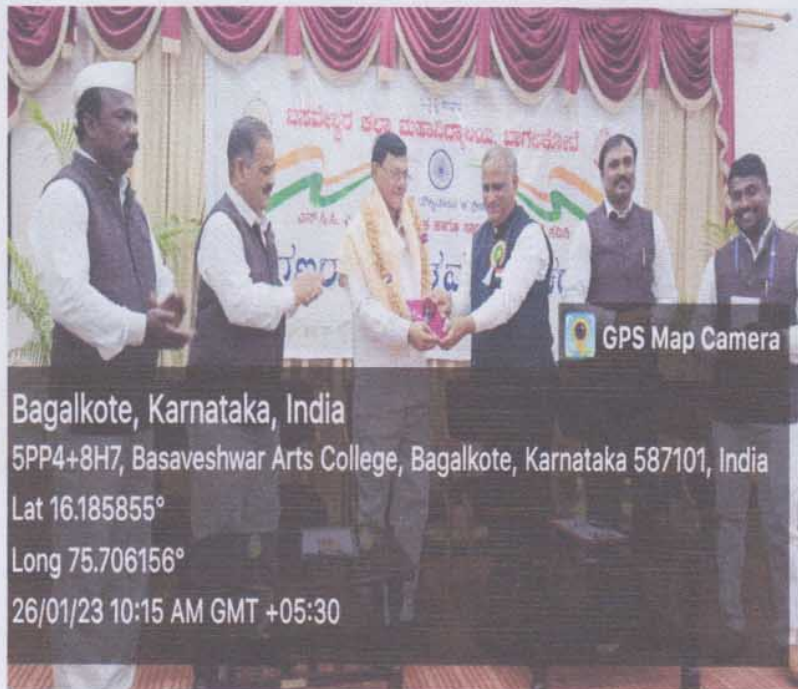
Wearing Khadi as on a occasion of our college Functions

GPS Map Camera Bagalkote, Karnataka, India 5PP4+8H7, Basaveshwar Arts College, Bagalkote, Karnataka 587101, India Lat 16.185855° Long 75.706156° 26/01/23 10:15 AM GMT +05:30