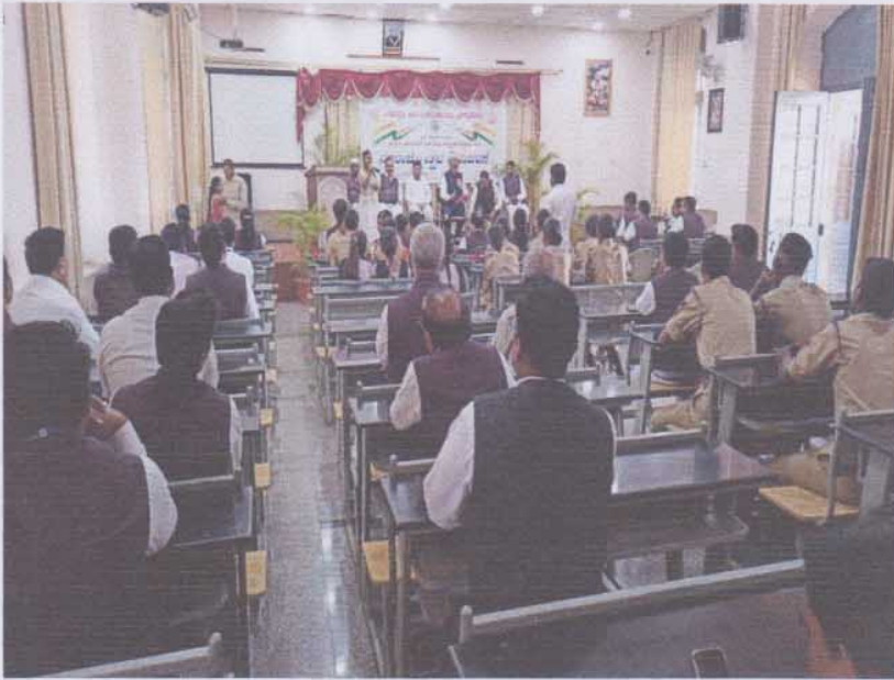
Wearing khadi as an occasion of National