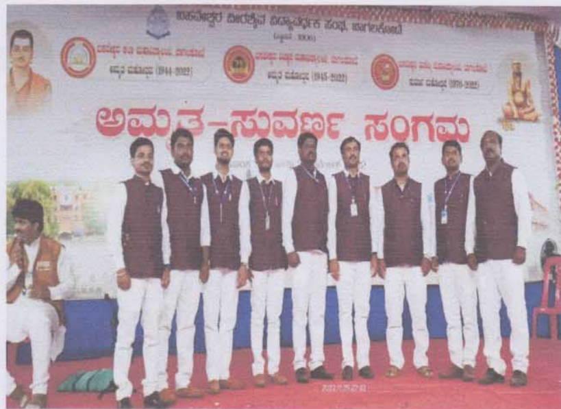
Wearing Khadi Uniform

Accepted Co-ordinator, IQAC Basaveshwar Arts College BAGALKOT.