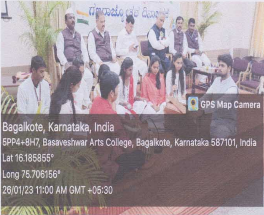
Wearing Khadi as on a occasion of National Festivals

Bagalkote, Karnataka, India 5PP4+8H7, Basaveshwar Arts College, Bagalkote, Karnataka 587101, India Lat 16.185855° Long 75.706156° 26/01/23 11:00 AM GMT +05:30