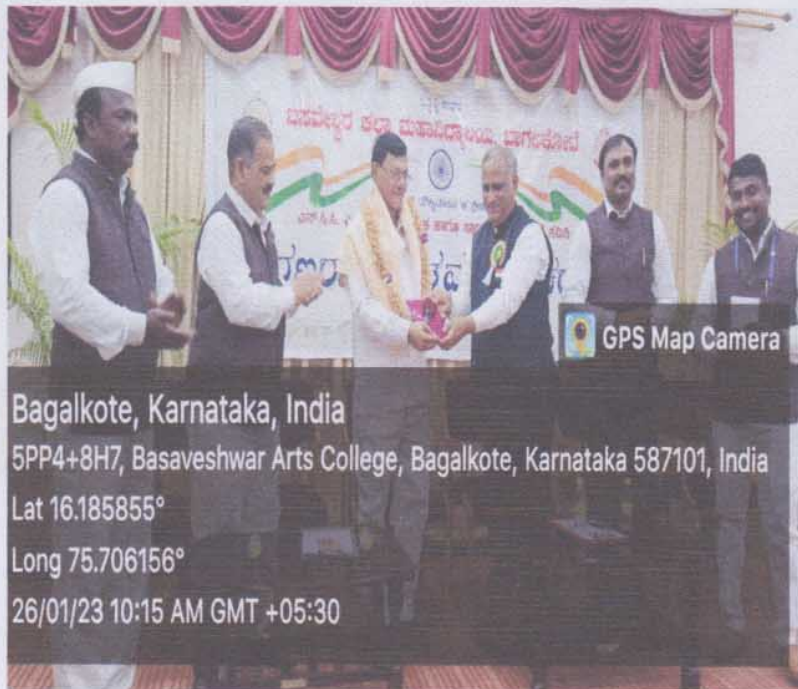
Bagalkote, Karnataka, India 5PP4+8H7, Basaveshwar Arts College, Bagalkote, Karnataka 587101, India Lat 16.185855° Long 75.706156° 26/01/23 10:15 AM GMT +05:30

APC Allied Co-ordinator, IQAC Basaveshwar Arts College BAGALKOT.